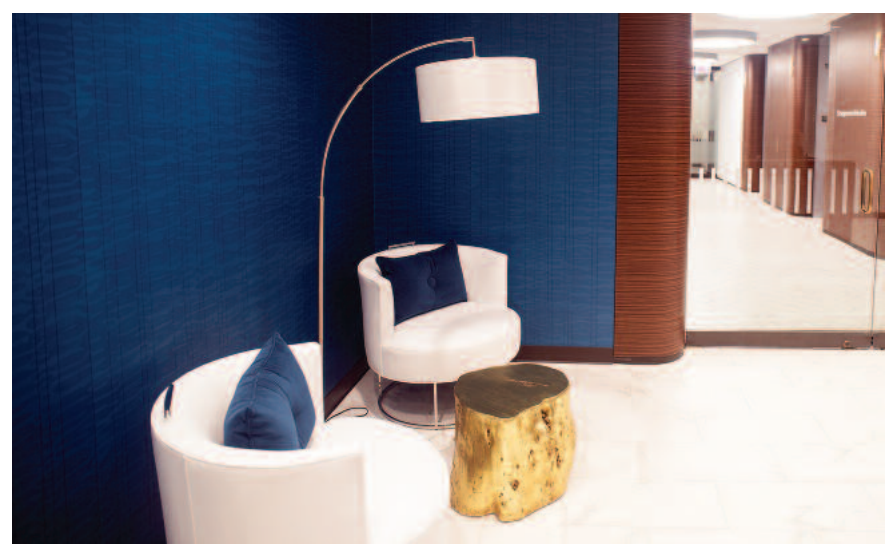
Sheppard Mullin's renovations happened during work hours, so employees had to navigate around construction.

"We could've lived with the kitchen at the size it was, but we didn't need the room for files anymore, and it would've just become