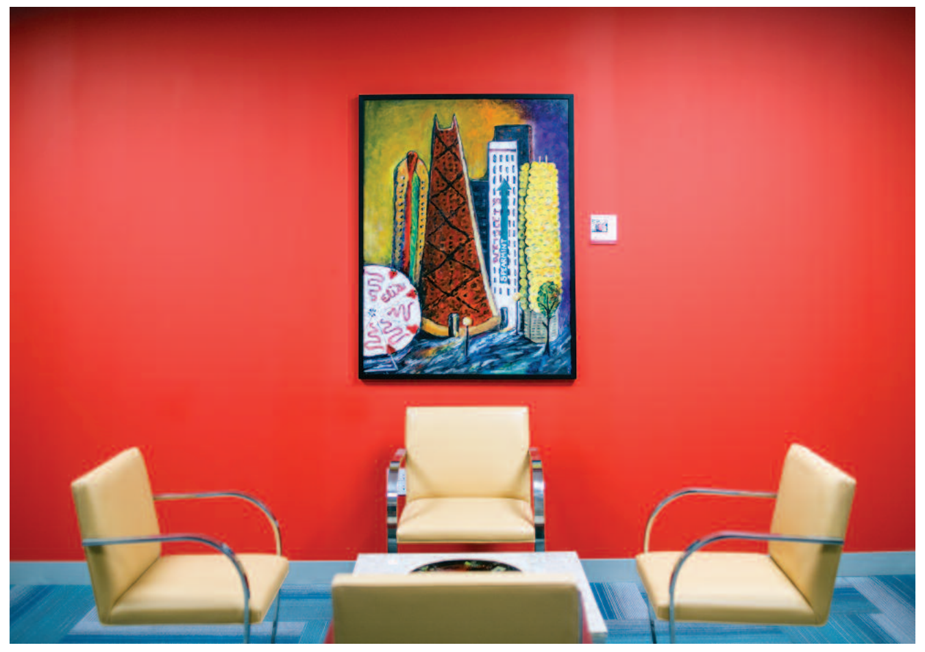
Before signing a new lease at 3 First National Plaza, the partners at Sheppard Mullin Richter & Hampton insisted that physical upgrades be made to the space.